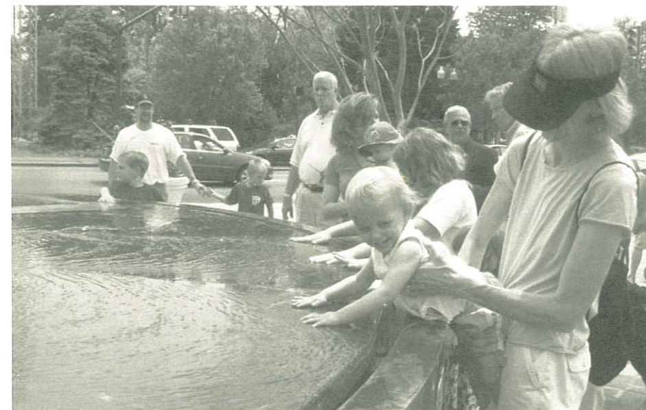
The fountain at the new Town Green is popular with visitors. See page 7 for "This Month on the Green" schedule of free performances for children and adults.

Thanks to all citizens who took the time to vote as well as those who served as election officers.