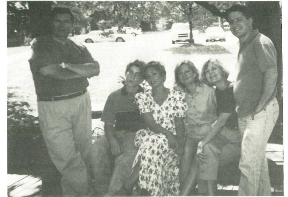
"MARVIN'S ROOM" AT THE COMMUNITY CENTER — Members of the Vienna Theatre Company take a break during rehearsals for "Marvin's Room," which will be presented at the Vienna Community Center October 23, 24, 29 and 30 at 8 p.m. and October 25 at 2 p.m. (signed performance). Tickets are $8 general admission and $7 for students and senior citizens aged 65 and older. Congratulations to the Vienna Theatre Company for winning its second Ruby Griffith Award for the 1997 production of "Brighton Beach Memoirs"!

"Fall Photo Frolic" photo album workshop will be held at Marshall High School, 7731 Leesburg Pk., on Saturday, October 24, from 9 a.m. to 2:30 p.m. Sponsored by Creative Memories, a company specializing in acid-free albums and supplies. The fee of $20 per person includes classes, morning breakfast bar, afternoon dessert bar, table favors, and prize draw-