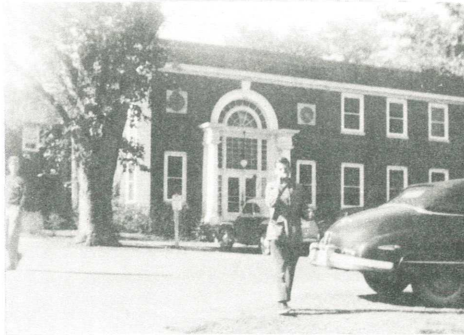
circa 1935