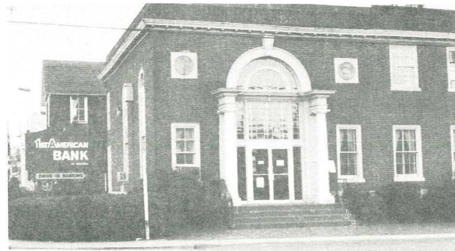
1989 - photo by Judi Barker Medwedess