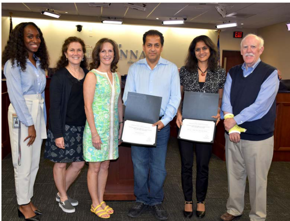
Representatives from Vocelli Pizza and Trace-The Zero Waste Store receive Sustainability Challenge Certificates at the May 16, 2022 Vienna Town Council meeting.

To see a list of past winners, and to learn more details about applying for this year's Sustainability Challenge, visit www.viennava.gov/sustainabilitychallenge . The application deadline is April 21, 2023. Awardees will be announced in May 2023 to coincide with Business Appreciation Month. 📺