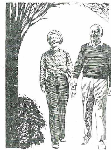
Keep branches and shrubs trimmed to give pedestrians plenty of room both above and to the side of walkways!

It is recommended that shrubbery be trimmed in a curved shape away from the sidewalk so that sunlight reaches the lower branches.