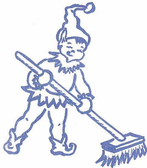
EGBERT THE ELF

We have begun this year with the announcement of a contest to give the whole program an appropriate title. The contest rules and entry blanks have been widely distributed through the local stores, schools and newspapers, but are reprinted on these pages for your convenience. The contest lasts until February 1st, and a panel of judges will select the winning name from the entries. Once we have the program named, we will be ready to launch an all-out publicity campaign to rally the support of the whole community and spotlight the Town's efforts throughout the area.