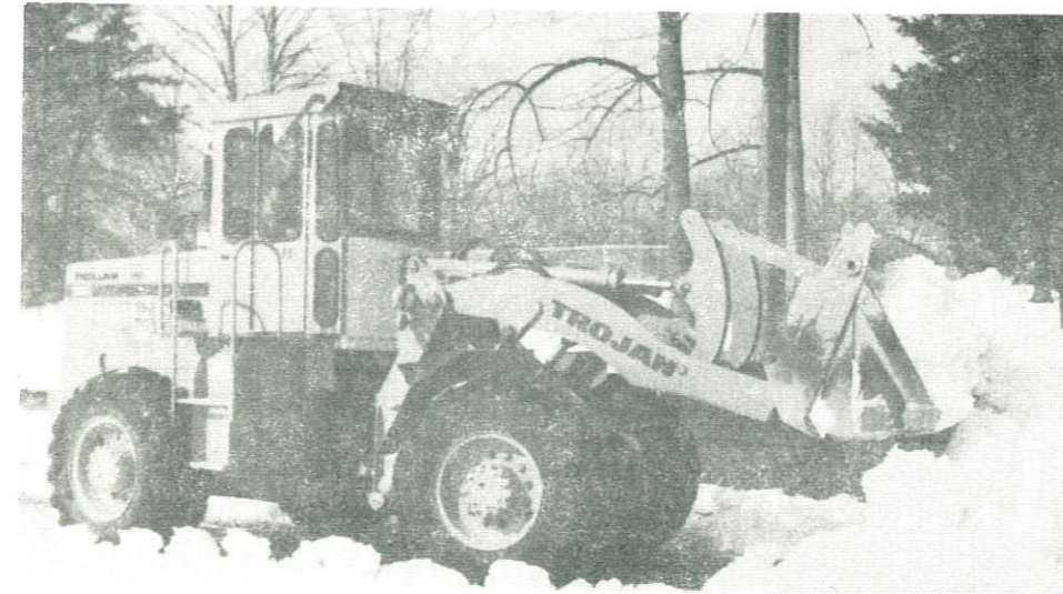
Thanks to equipment like this front-end loader and over 2,000 man-hours of labor, Vienna dug out of February's snowstorm with no major problems.

The snowstorm of February 10-11 will go down in history as the "Blizzard of '83." It was one of the biggest and costliest storms ever.