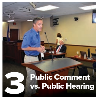
3 Public Comment vs. Public Hearing