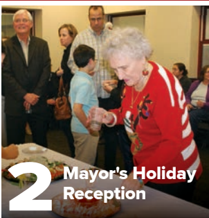
2 Mayor's Holiday Reception