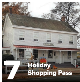
7 Holiday Shopping Pass