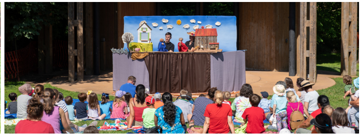
prior to COVID-19