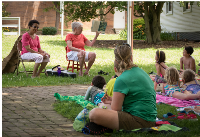
prior to COVID-19