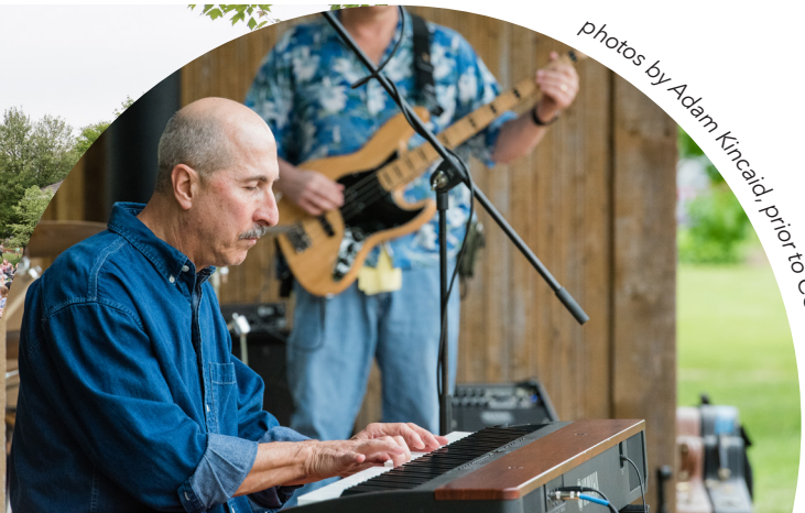
prior to COVID-19