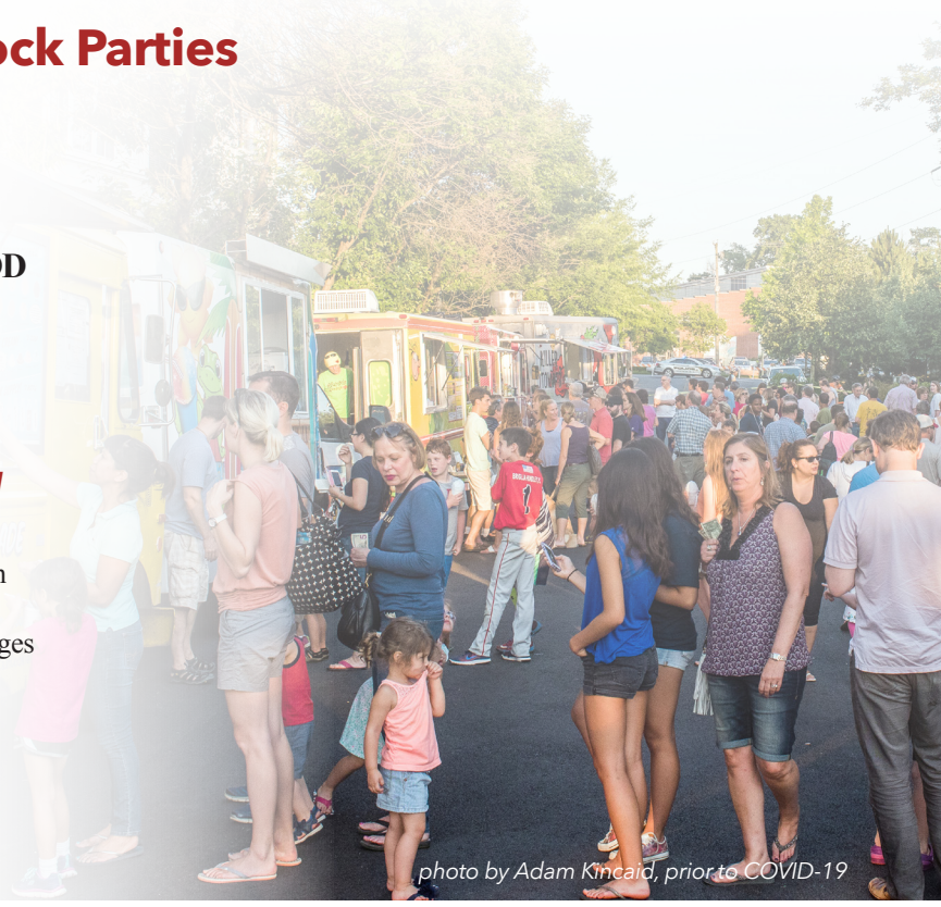
prior to COVID-19

More info at viennava.gov/chillin . Please wear a face covering if you are not vaccinated. 🙅