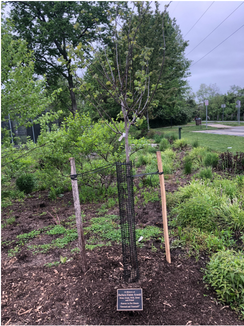
Tree planted at the Vienna Community Center with a commemorative plaque