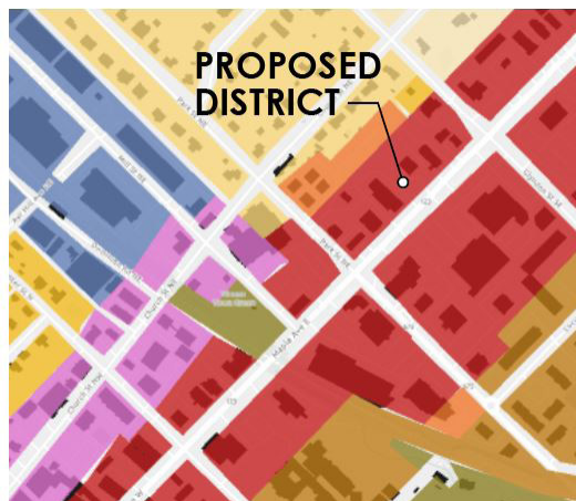
Districts vs zones The map on the left shows existing zoning scattered along Maple Avenue; the map on the right demonstrates a proposed district of one combined geographic area.