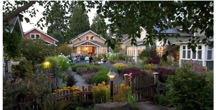
Exploring the options Cottage housing, as illustrated in this photo, is one of the alternative multifamily options up for discussion as part of the zoning code update process.