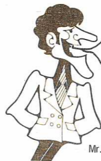
Mr. Max Facts

For information about the opening hours of the free health clinics contact the Joseph Willard Health Center at 691-2161 or the Northwestern District office at 534-8343.