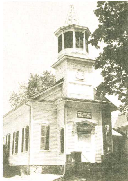
Historic Vienna is proud of the 100th birthday of the old Presbyterian Church at Mill and Church Streets. The church was built in the "Fall of 1874."

The option was offered after numerous complaints were received from residents wanting the discontinuation of metal tag registrations.