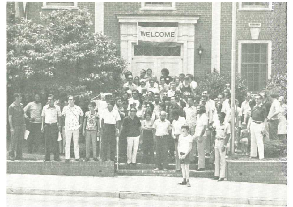
A BIG WELCOME—Over 50 foreign guests celebrated the Fourth of July with Vienna residents. Pictured here are the visitors and their Vienna sponsors.