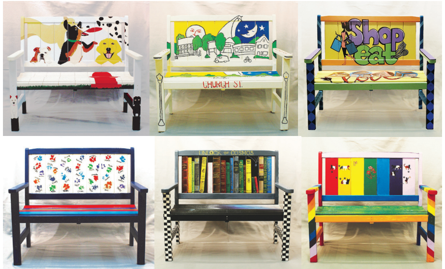
Vienna gets benched These Vienna Arts Society-created benches are among the eight that will remain on display in public locations following a November 2 live auction.