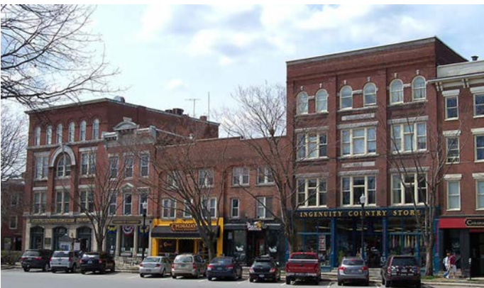
Ups and downs This photo of Keane, New Hampshire, downtown storefronts with varying roof heights was the most preferred building image in the recent MAC visual preference survey.

Some respondents expressed a desire that the survey had included photos of buildings less than three or four stories. However, the Town’s current zoning ordinance allows for three-story construction on Maple Avenue “by right” and a key component of the MAC is the provision for four-story, mixed-use development. 📌