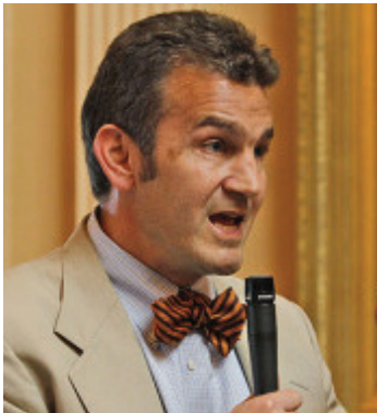
Sen. Chap Petersen

Learn more about the 2017 Legislative Agenda at a Town Hall meeting at 9 am Saturday, January 21, at – where else? – Town Hall, 127 Center Street S. 📍