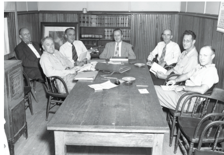
Town Council, 1947