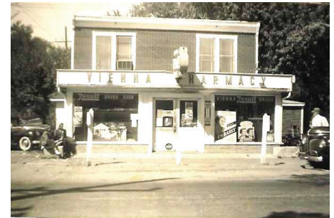
Vienna Pharmacy back in the day.