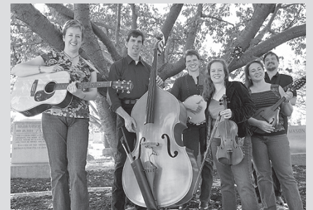
Dead Men's Hollow, June 26

For more information about these events, check the Summer 2016 parks and rec guide at viennava.gov or call 703-255-6360.