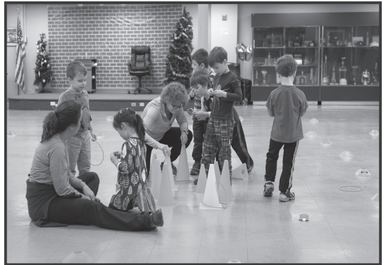
Never too young for social connections Many of Vienna’s programs are geared toward children.

For children, course offerings include three distinctive “doodlers” arts and craft classes beginning January 12, a clay studio on January 25, and Minecraft animation on