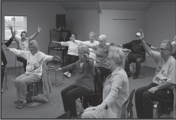
Never too old to exercise The Town of Vienna offers fitness classes for people of all ages.

The Parks and Recreation Department is offering nearly 100 classes, camps, events, and trips for people of all ages – from newborns to mature adults – through the winter quarter.