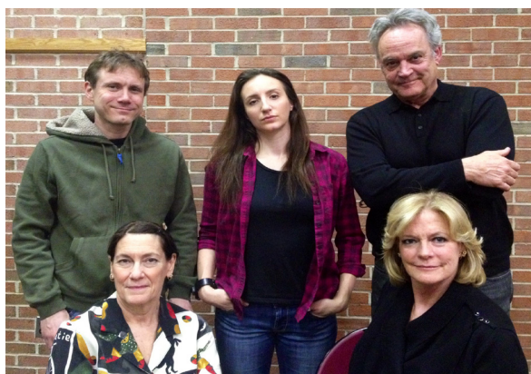
Actors portraying the fictional Wyeth family for the upcoming production of the “Other Desert Cities”

To reserve tickets email vtcshows@yahoo.com