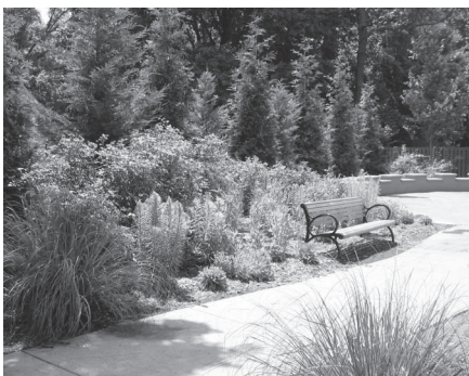
Sarah Walker Mercer Park

Don't forget your binoculars when you go to Northside Park. Wildlife is plentiful as you walk along the streams and walking trail in this 26 acre natural area in NE Vienna. Nothing stirs a kid's imagination like the woods! SE Vienna is home to the Branch Road Tot Lot with a wonderful play area for kids aged 2 to 5.