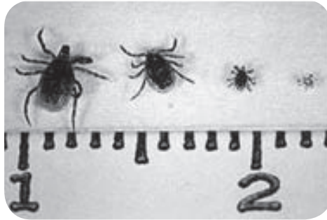
From left to right: The deer tick ( Ixodes scapularis ) adult female, adult male, nymph and larva on a centimeter scale. Note: Tick larvae do not transmit Lyme disease.

and slowly taking in blood. Both deer and rodent hosts must be abundant to maintain the enzootic cycle of Borrelia burgdorferi . Ixodes ticks are most likely to transmit Lyme disease to humans after feeding for two or more days.