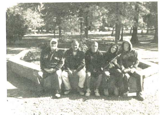
The completed Eagle Scout project at the Community Center completed in October 2010.

Have a wonderful and joyful holiday season.