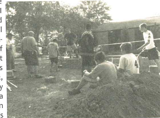
The Boy Scouts hard at work on the Eagle Scout Project at the Community Center: Interlocking Stone Wall Landscape Bed. October 2010.

As we enter the holiday season, I would like to share with you the appreciation felt by the many Boy Scouts in Vienna who have benefited from the special partnership that has developed between the Department of Parks and Recreation maintenance staff and the various Boy Scout troops, especially those scouts who have worked at obtaining the rank of Eagle Scout. This is the highest rank attainable in the Boy Scouting program, which only about two percent of the scouting membership are able to obtain. I have experienced this wonderful partnership firsthand as one of the Assistant Scoutmaster's in Troop 152, sponsored by the Vienna Presbyterian Church, which is one of several Boy Scout troops based in the Vienna area.